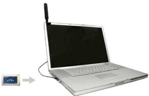
Laptop equipped with Ubiquiti SRC + external antenna