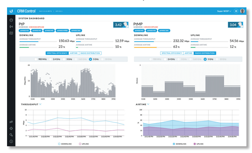
System Dashboard for Real-Time Network Monitoring