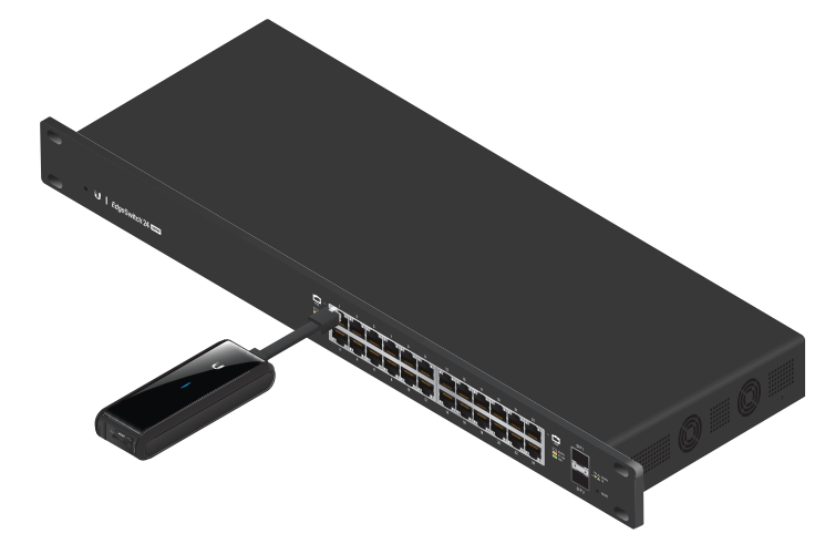
CRM Point Deployed with 802.3af Ethernet Switch

The U CRM Control software and all of its data are stored locally on the CRM Point, eliminating the costs associated with third-party cloud storage.