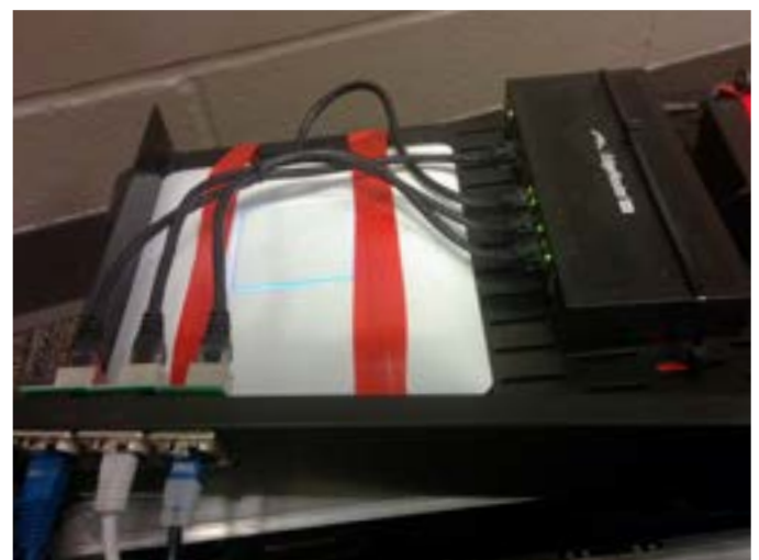
UniFi AP AC connected to an EdgeRouter Lite

"My two priorities are speed and consistency," he said. "With UniFi, I can get the network up in thirty minutes and I don't have to worry about it again. I can focus on getting through the show without ever having to worry about the network faltering."