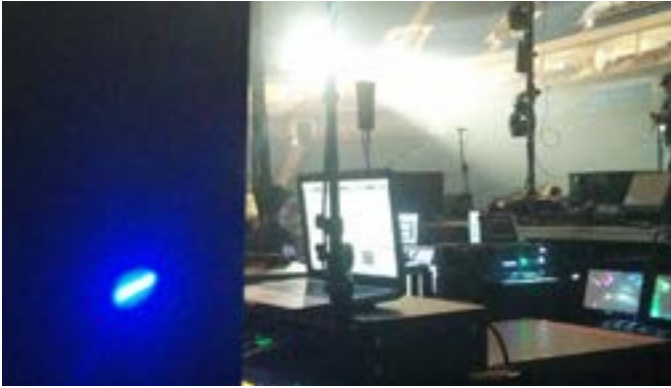
UniFi Outdoor AC powers the tech booth