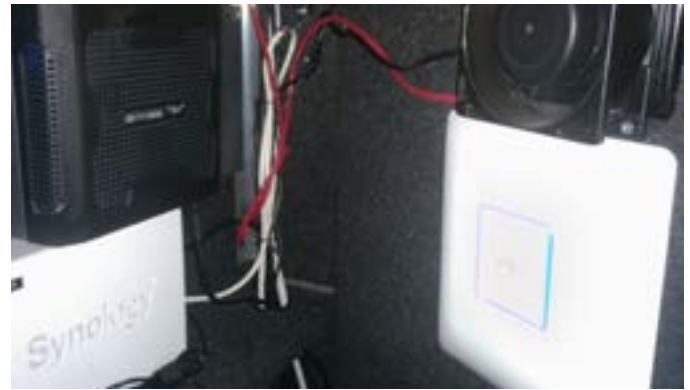
UniFi AP AC connected to a ToughSwitch PoE