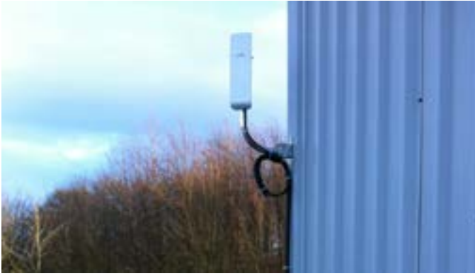
NanoStation M5 CPE