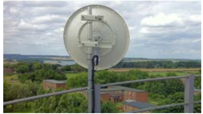
Rocket M5 access point with RocketDish

Because Internet access is campus wide, military personnel can connect anywhere on the site instead of waiting until they are back in their room. Wifinity uses the same account system across all sites; Internet can be used at any barracks and is extremely portable and well-suited to a soldier's mobile lifestyle. The installation contains the following Ubiquiti products: