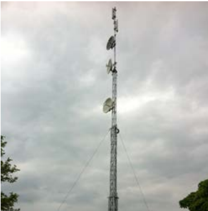
Rocket M5 access points attached to RocketDishes and sector antennas