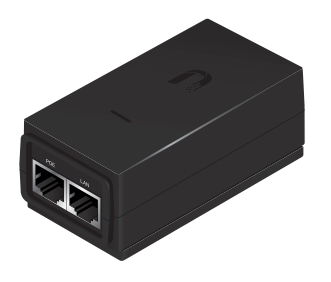
POE-15-12W POE-24-12W POE-24-12W-G