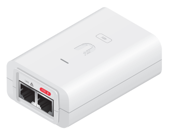
POE-48-24W-WH POE-24-24W-G-WH POE-48-24W-G-WH