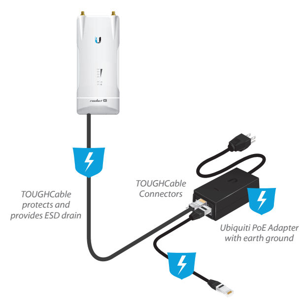
Ubiquiti PoE Adapters and TOUGHCable protect against ESD events in a network.